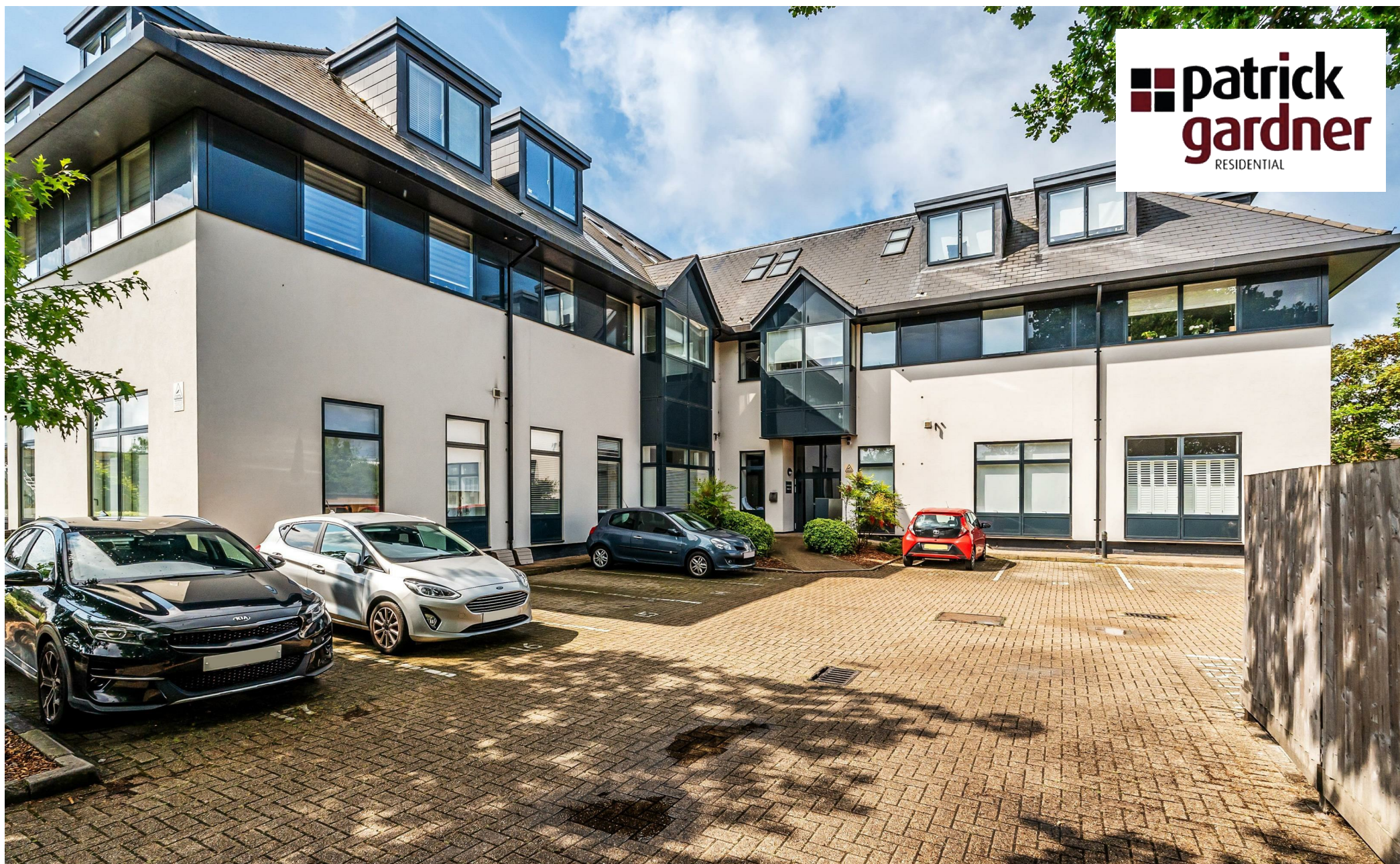
Flat 5, Tanner House Challenge Court, Leatherhead, Surrey, KT22 7GS